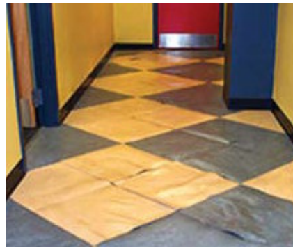
Fig. 1: Problems such as these warped and bubbled floor tiles can be caused by moisture and moisture-induced high pH levels beneath the flooring materials

To understand what happened on this project and many others, we must examine a test method that is commonly used in the U.S. to quantify the moisture vapor emission rate (MVER) of a concrete subfloor. The method, the calcium chloride test developed by the Rubber Manufacturers Association (RMA) in the 1950s, is now published as ASTM F 1869 1 by ASTM International. MVER testing by the calcium chloride method involves placing an open dish containing a specified, known weight of anhydrous calcium chloride crystals beneath a plastic dome that is sealed to the concrete surface for 60 to 72 hours (Fig. 2). During the test, the crystals absorb