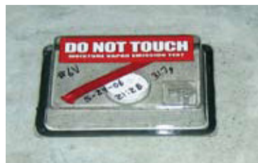
Fig. 2: Typical calcium chloride test kit containing a dish, calcium chloride crystals, and a plastic dome

moisture vapor in the air beneath the plastic dome. At the end of the exposure period, the difference between the initial and final weight of the crystals is used to calculate the MVER in pounds of water per thousand square feet per 24 hours (commonly referred to simply as “lbs”).